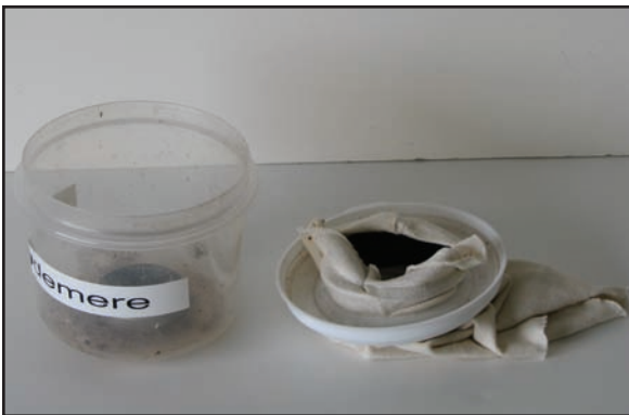
Modified Collection Jar