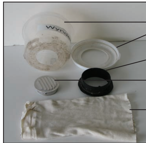
Plastic Container & Lid