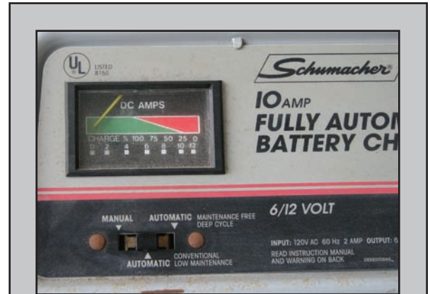
Close up views of battery charger