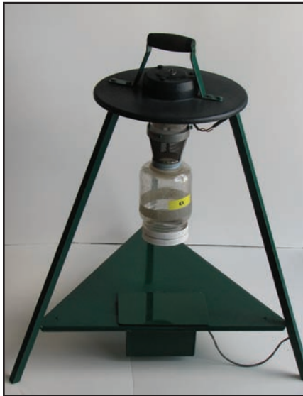
Stand w/ trap